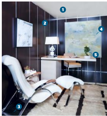
STUDY DESIGNED BY MARK CUTLER FOR CORUM

1. The water in this fountain flows from the ceiling down a plate of glass and in front of the open fireplace. 2. Epiphytes: plants commonly found in rain forests that gather water on their leaves and are thus a little harder to kill. 3. The walls are covered in bamboo, faux snakeskin, and faux ostrich. 4. The ceiling is faux leather. 5. The furniture, however, is actual cashmere. 6. The Ameba pendant light fixture—a five-piece customizable set that can be combined into an infinite number of shapes. 7. Over the dining-room table is the Luceplan Hope light, which comprises eighty-four magnifying lenses and cannot be combined into any other shapes. 8. On the east wall is a $250,000 Jean-Michel Basquiat painting called Back of the Neck .